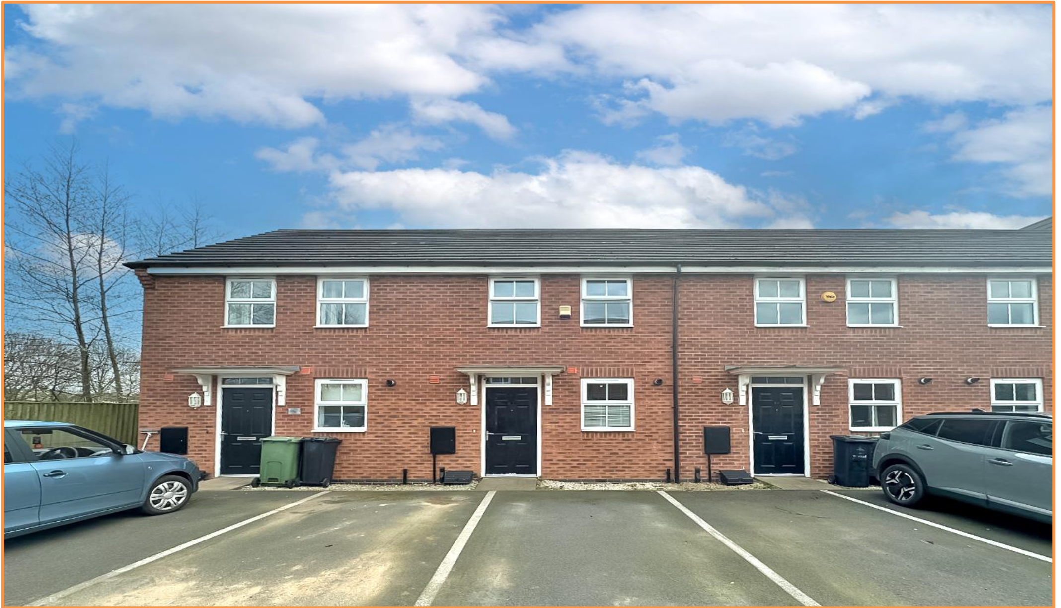
Water Reed Grove, Walsall, WS2 7AE